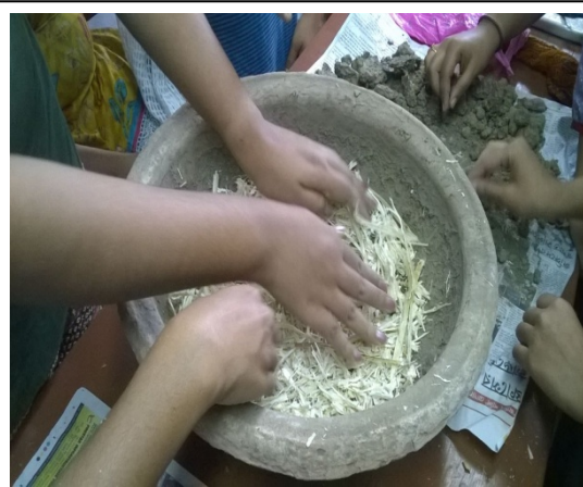
Fig 1. Preparation of vermicomposting bed using different materials.

Vermicompost in soil was not uniform. The rate of decomposition of V1 was most rapid followed by V2, V3, and V4 in decreasing order. However, V1 retained maximum amount of organic carbon. The increase in the total nitrogen content of soil by the addition of different types of Vermicompost supported the report of Jambhekar (1992). V1 resulted in the highest increased followed by V3, V2 and V4 respectively. However, the sequential influence of different Vermicompost on total nitrogen in soil was concurrent with the total nitrogen content of the said vermicomposts.