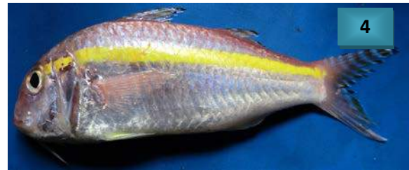
Fig.4. Upeneus moluccensis (Bleeker, 1855), Goldband goatfish.

D: VIII+9; A:I,7; P: 15; V: I, 5; GR: 27-29; LL: 33-36; Body elongate, depth 3.5 – 3.83 times in standard length. A pair of white to pink chin barbules not reaching to rear border of preopercle and 1.78-1.94 times in head length. Proportion of eye diameter to head length is 4.01 - 4.71 and proportion of head length to standard length is 3.24 - 3.75. Two dorsal fins widely separated by 5½ vertical rows of scale, the first dorsal spine very small.