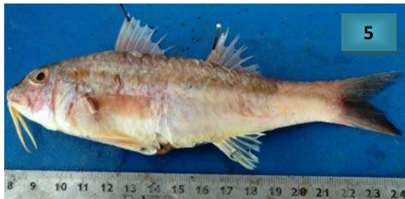
Fig.5. Upeneus sundaicus ( Bleeker,1855), Ochre – banded goatfish.

D: VIII+I,8; A: I,7 ; P: 15 ; V: I,5 ; GR:22 ; LL:32; Body elongate, depth 3.75 times in standard length. Chin with a pair of barbel which extending slightly beyond rear margin of preopercle, their length 1.68 times in head length. Proportion of eye diameter to head length is 4.47 and proportion of head length to standard length is 3.65 First dorsal spine very small. 4½ vertical rows of scale present in inter-dorsal space. Ventral fin almost equal to pectoral fin. Body greenish dorsally, yellowish white ventrally, with a brownish yellow stripe from eye to mid base of caudal fin. Dorsal fin yellowish with pale reddish base. Caudal fin brownish yellow, lower lobe of caudal fin with dusky posterior margin narrow towards the lobe. Barbell orange