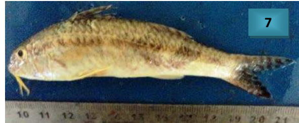
Fig.7. Upeneus tragula Richardson, 1846, Freckled goat fish.