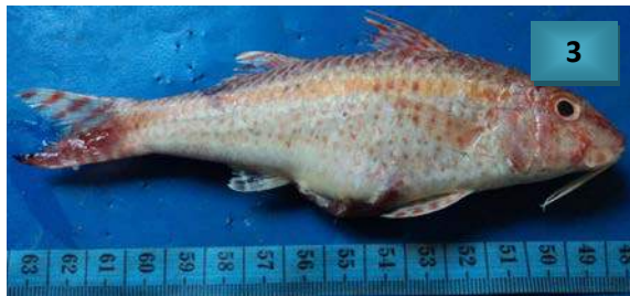
Fig.3. Upeneus luzonius Jordan and Seale, 1907, Dark-barred goatfish.

D: VIII+ I,8 ; A:I,6 ; P:14 ; V:I,5 ; GR: 23-25; LL: 29-30. Body elongate, depth 4.00-4.25 times in standard length. Chin with a pair of barble that extend posterior to rear border of preopercle, their length 1.38-1.48 times in head length. Proportion of eye diameter to head length is 3.51-3.93 and proportion of head length to standard length is 3.58-3.93. Two dorsal fin separated by 4½ vertical rows if scale, the first with 8 spine, first spine is very small. Pelvic fins slightly shorter than pectoral fins. Body brownish red, three saddle like broad dark bars present, first one below 1 st dorsal fin, second below second dorsal fin and the third one present on caudal peduncle. Both lobe of caudal fin contains 4 to 6 oblique dark bars, those of lower lobe more prominent (Fig. 3).