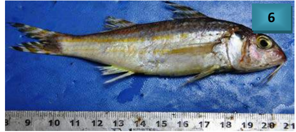
Fig.6. Upeneus taeniopterus (Cuvier, 1829) Fins tripe goatfish.