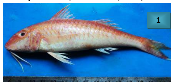
Figure 1. Parupeneus heptacanthus (Lacepede, 1802), Cinnabar goatfish.

from Andhra Pradesh coast (Barman et al., 2004); Tamilnadu coast (Krishnan et al., 2000) and Gujarat coast (Barman et al., 2000).