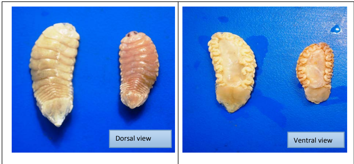
Fig. 1. Norileca indica Milne-Edwards, 1840.