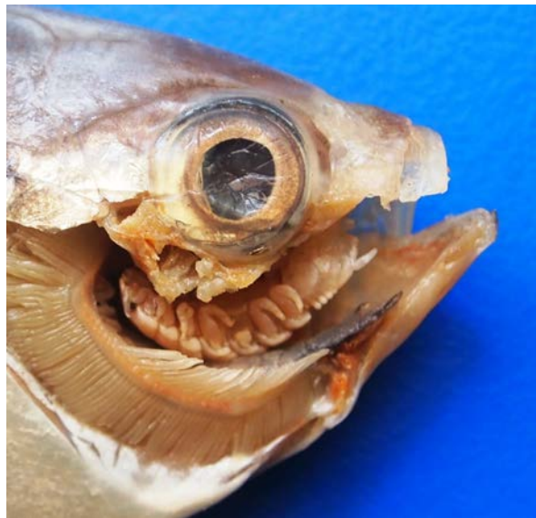
Fig. 2. Norileca indica Milne-Edwards, 1840 inside the buccal cavity of Rastrelliger kanagurta (Cuvier, 1816).