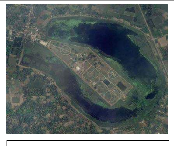
Fig. 1. Map of the Study Area.

Motijheel Lake is a scenic horse she shaped fresh water lake, which was excavated by Nawazesh Mohammad. The jheel was famous for raising golden tinted pearls from Unio margaitifera species. The lake is located between 24.9'12" to 24.9'42" N and 88.16'33" to 88.16'13"E, 7 km north of Berhampore town in the Murshidabad district of West Bengal, India (Fig.1).