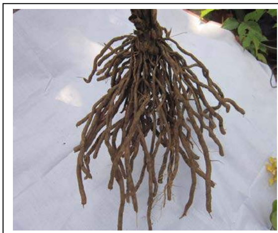
Figure 2. Roots of Asparagus racemosus .

The present study is aimed at the development of phytochemical parameters and to investigate the medicinally active substances present in methanolic ethanolic and aqueous extract obtained from roots of Asparagus .