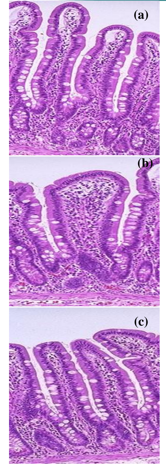
Figure 3. Microscopic appearance of ileum of Wistar albino rat (a) Group I - Control Feed (b) Group II ungerminated Vigna aconitifolia Feed (c) Group III germinated Vigna aconitifolia Feed

Section from intestine showed ileum. The section showed a normal histological pattern with villus and mucus-secreting epithelial cells. No evidence of hyperplasia and edema was observed.