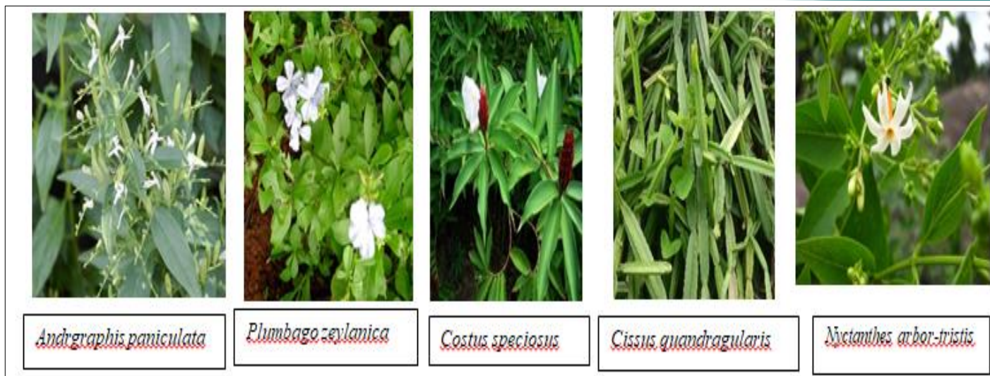
Figure 2. Experimental Plants.