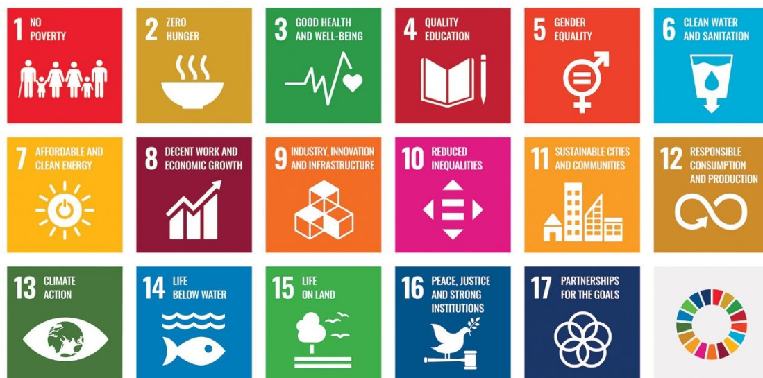
The United Nations Sustainable Development Goals (SDGs).