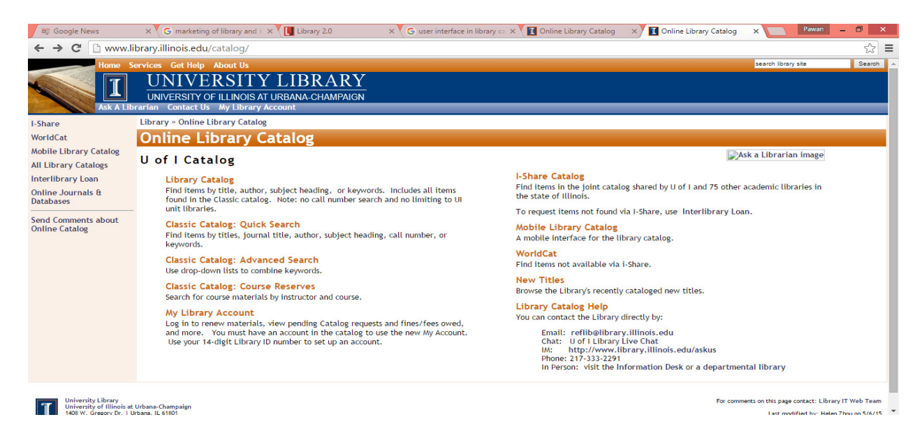
Figure 3: University of Illinois at Urbana – Campaign (http://www.library.illinois.edu/catalog/)

User interface is considered one of the significant feature in next generation catalogue to attract the users of library. University of Illinois at Urbana –Campaign's library catalogue is proving user centric interface in figure 3. In which a user is allowed to create his/her account, can share the bibliographic details, mobile library access and more.