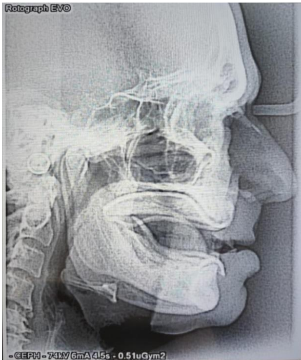
Figure 2: Lateral cephalogram