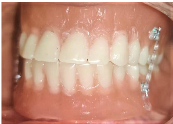
Figure 5 c: Intro-oral view of final denture