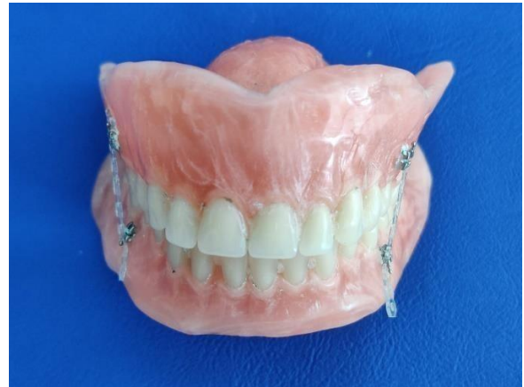
Figure 4: Upper and lower denture kept in maximum intercuspation using elastics

(@DPI-RR cold cure-acrylic repair material) and zinc oxide eugenol impression material (@DPI Impression paste) after border molding with impression compound modelling plastic (@DPI PINNACLE; Tracing sticks).