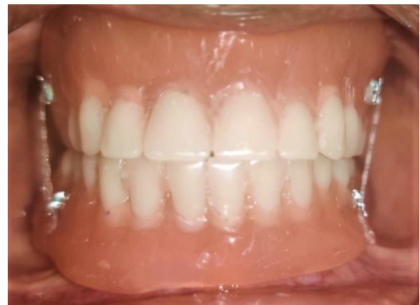
Figure 5 a: Intro-oral view of final denture

The mandibular relationship was recorded by asking the patient to elevate the tongue to the most posterior part of the palate that he was able to reach and close in the retruded position. The teeth arrangement was based on balanced occlusion. Trial dentures were evaluated. Still, the patient exhibited mandibular deviation and protrusion in his habitual mandibular position (figure 1) This position was confirmed by making a lateral cephalogram (figure 2). After the trial, orthodontic brackets were incorporated on the buccal flanges of both upper and lower dentures extra-orally (figure 3). Trial dentures were completely waxed up and then processed by using the conventional wax elimination technique. After finishing and polishing, the definitive dentures were evaluated intraorally. Both the dentures were removed and they were kept in the maximum intercuspation position.