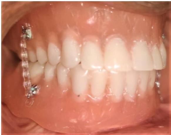
Figure 5 b: Intro-oral view of final denture

was positioned on the edentulous ridge following which the patient was asked to gently close his mouth. Since the dentures were already locked in maximum intercuspal position (centric relation), they served as a guide to help the patient close in centric relation position. After insertion, the patient was asked to remove the elastics. The patient was instructed to insert both the dentures as a single unit by following the same protocol for a minimum of three months. The patient was recalled after three months and denture evaluation was done. At this point, the patient was able to close in centric relation when the dentures were inserted separately without the use of elastics. He demonstrated the absence of mandibular deviation and protrusion with increased mastication and deglutition activity. Also, the patient subjectively indicated satisfaction with the treatment. At the end of the recall visit, orthodontic brackets were removed.