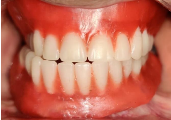
Figure 1: Habitual mandibular position

Preliminary impressions were made by using stock trays and irreversible hydrocolloid (DPI Algitek®). Definitive impressions were made by using custom trays made from auto-polymerizing acrylic resin