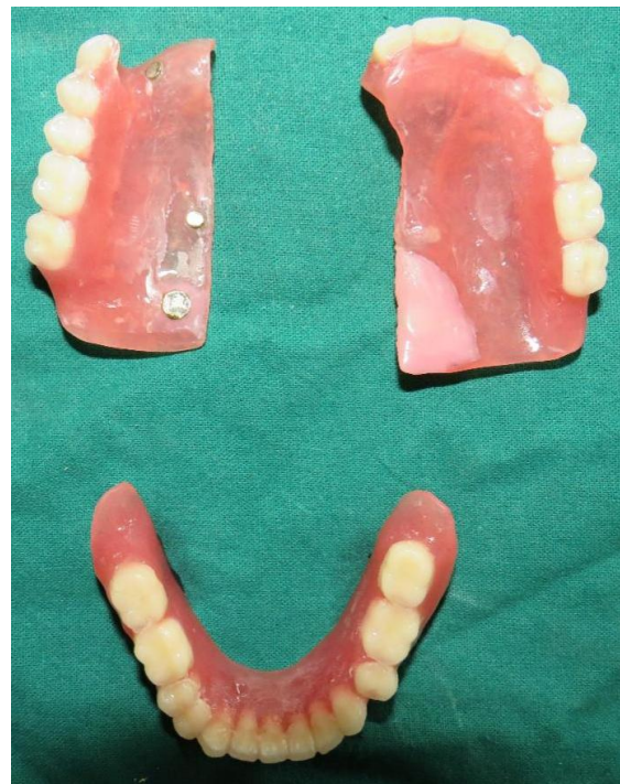
Figure 8: Acrylised and finished dentures