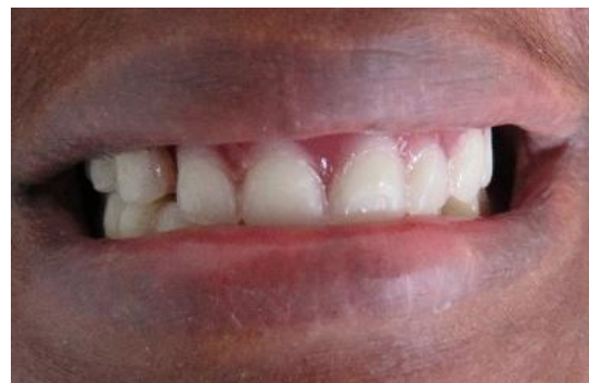
Figure 9: Satisfactory aesthetics and occlusion after denture insertion