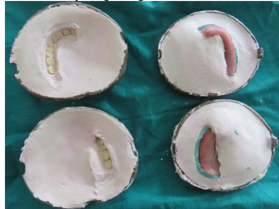
Figure 7: After dewaxing

The dentures were inserted and evaluation of phonetics and aesthetics was done, and was found to be satisfactory. (Fig 9, Fig 10)