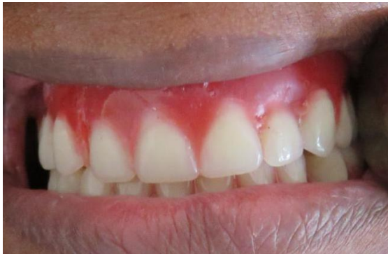
Figure 5: Wax try in

Teeth setting and wax try in was carried out in a conventional manner using the sectional denture bases with the occlusal rims on the maxillary cast and conventional denture base with occlusal rim on the mandibular cast. The wax try-in was satisfactory and aesthetically pleasing to the patient. (Fig 5)