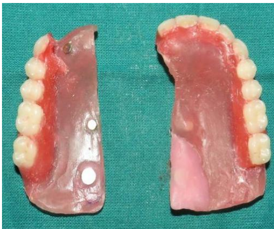
Figure 6: Waxed up dentures with magnet attached posteriorly

An additional samarium magnet of size 5mm in diameter was placed towards the posterior most part of the mid palatal raphe region to enhance the approximation of the sectional denture bases. (Fig 6)