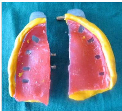
Figure 2: Border moulding done in sections

The special tray for the maxillary arch was fabricated by using conventional wax spacer design and light cure special tray material (Elite LC Tray, Zhermack, Germany). Multiple tissue stops were given in the spacer to facilitate proper orientation of the tray during the procedure. It was fabricated in two sections and joined using die pins (Fig 2). Sectional border molding was done using putty impression material (Elite HD+, Zhermack, Germany) and secondary impression was made with low-viscosity polyvinyl siloxane impression material (Elite HD+,Zhermack,Germany).Later the two sections were approximated by using die pins to obtain a single impression, for pouring the master cast.