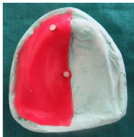
Figure 4: Wax up for duplication

The maxillary master cast was duplicated using putty impression material, to obtain the master cast as and when needed, during the fabrication of the sectional permanent denture bases. First, one half of the master cast was waxed up after incorporating 3mm diameter commercially available samarium magnets (Magneticks, India), one each in the region of anterior alveolar ridge and mid palatal raphe region. These magnets were stabilised in position using cyanoacrylate. This was acrylised using heat cure acrylic resin (DPI, India), finished and polished. (Fig 4)